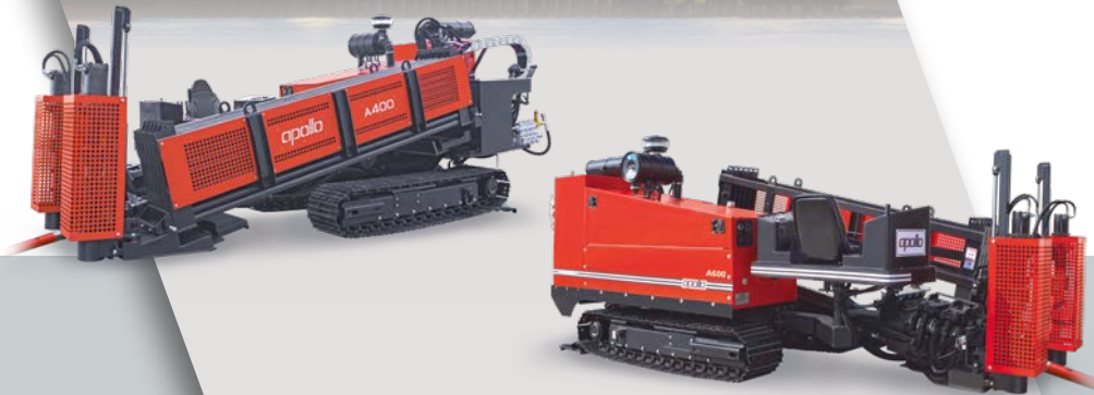
A400 & A600 HDD Horizontal Directional Drill Machine