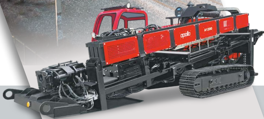
A1200 HDD Horizontal Directional Drill Machine with Operator Cabin