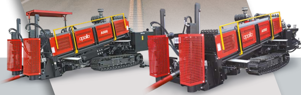
A900 & A950 HDD Horizontal Directional Drill Machine