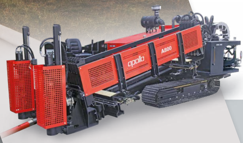
A800 HDD Horizontal Directional Drill Machine