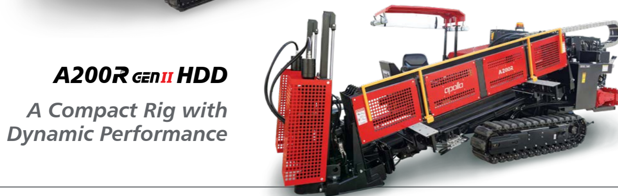
A200R GEN II HDD A Compact Rig with Dynamic Performance