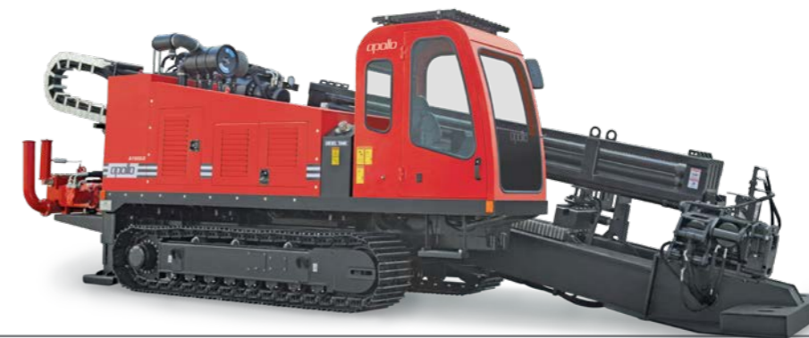
A1000R GEN II HDD Impressive Size with Increased Power