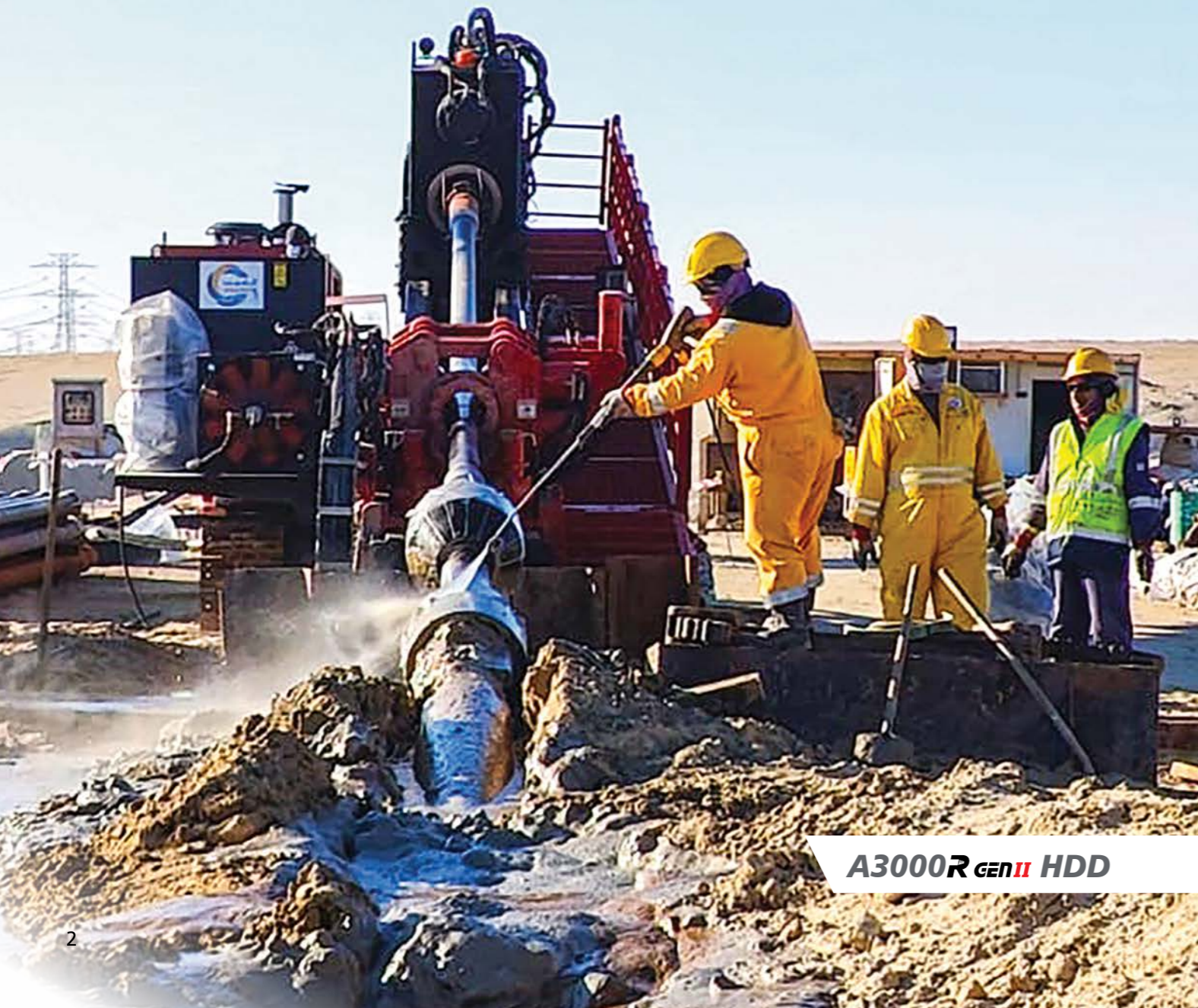
A3000R GEN II HDD

OPTIMUM PERFORMANCE with auto thrust & pullback capability and optimal rotational torque (3-speed) helps to install the product efficiently resulting increased productivity.