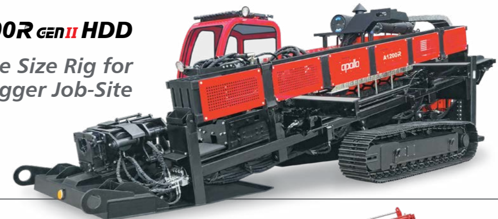
A1200R GEN II HDD A Large Size Rig for Bigger Job-Site