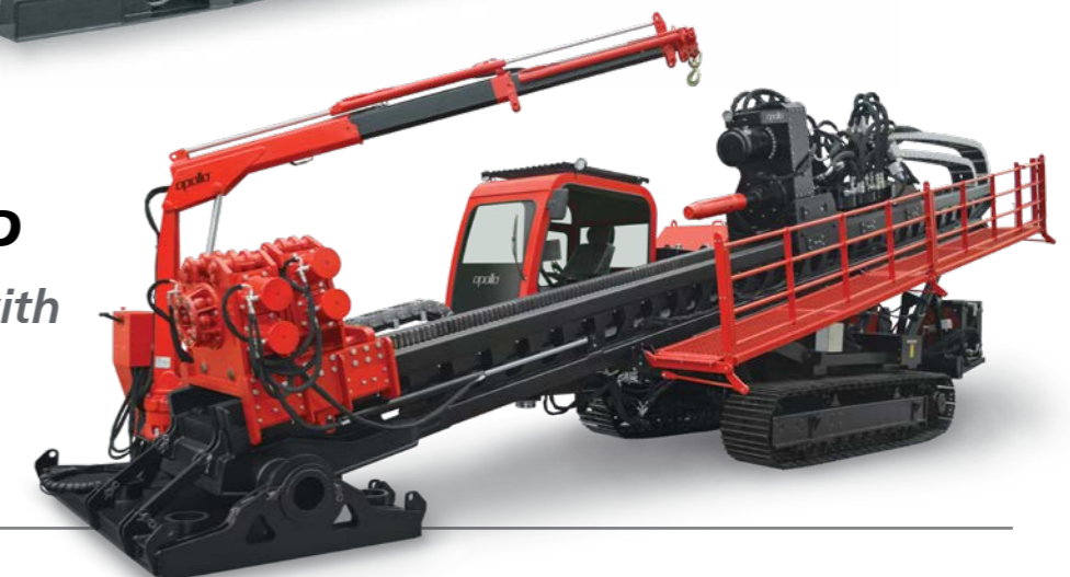
A2000R GEN II HDD Impressive Size with Increased Power