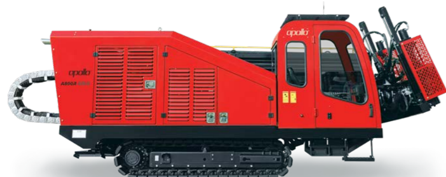
A800R GEN II HDD Powerful, Reliable, Rugged and Smallest Footprint in its Class