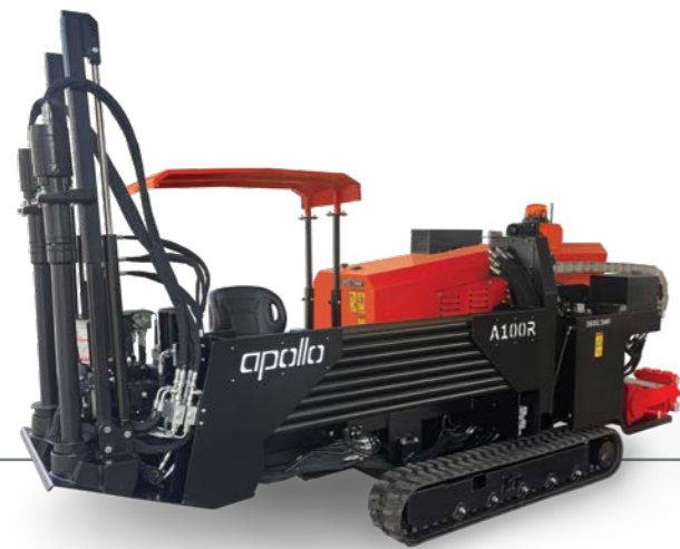
A100R GEN II HDD A Powerful Rig on Small Footprint